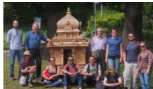
2015 Course Members

Division of Diversity and Informatics, Natural History Museum, Cromwell Road, London SW7 5BD, UK