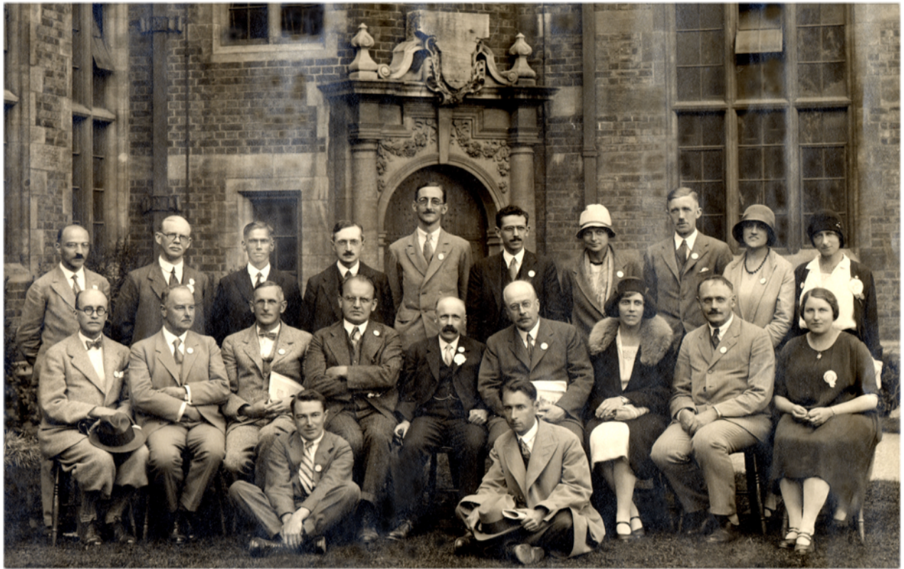
Fig. 3. Phycologists attending the International Botanical Congress, Cambridge, 1930.