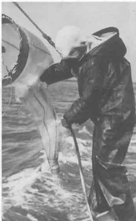
Attired in a wet suit, an investigator collects a sample from a plankton tow